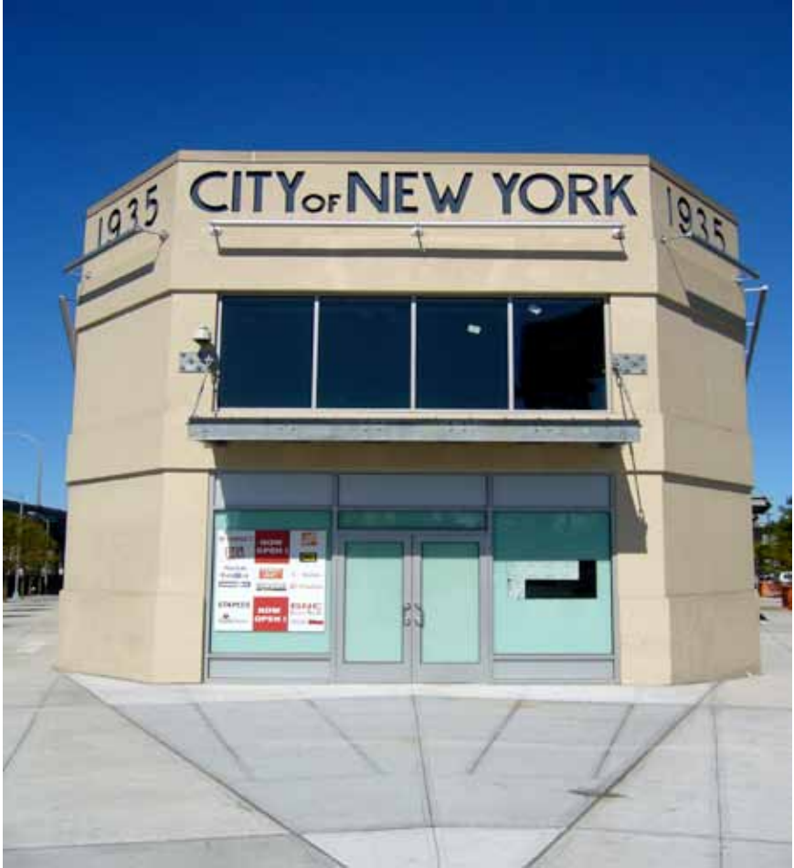
Bronx Terminal, Photograph by William Casari