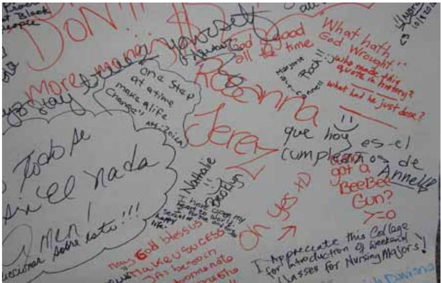
Writing on the wall at Hostos Community College