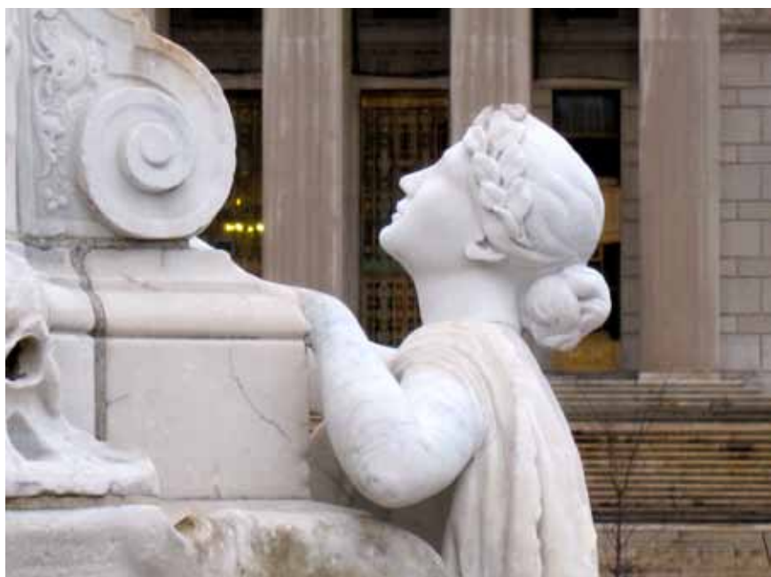
Lorelai Fountain, Grand Concourse.