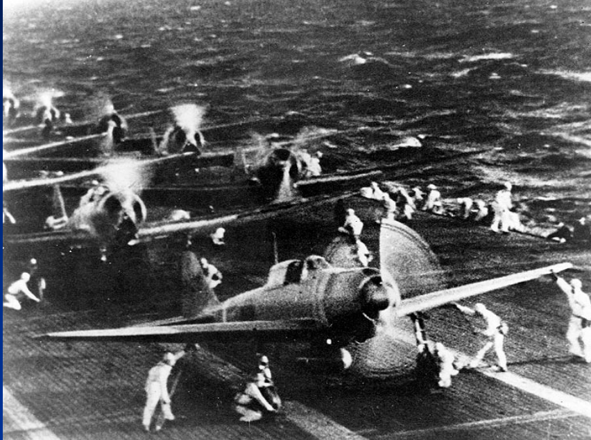
Photo # 80-G-71198 Japanese planes prepare to take off to attack Pearl Harbor, 7 Dec. 1941