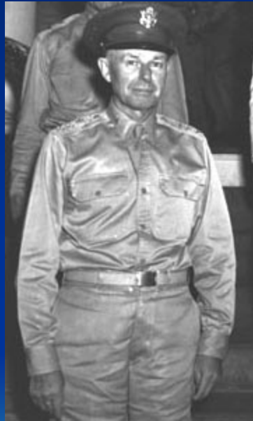
Lt. General Short