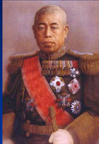
Admiral Yamamoto Commander of the Japanese Fleet.