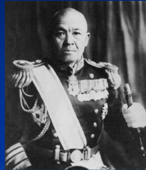
Vice Admiral Nagumo, Commander, Pearl Harbor Strike Force