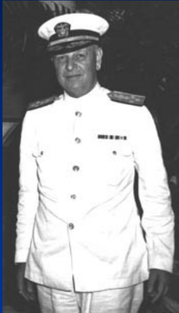
Admiral Kimmel Commander in Chief of the Pacific Fleet (CINCPAC)