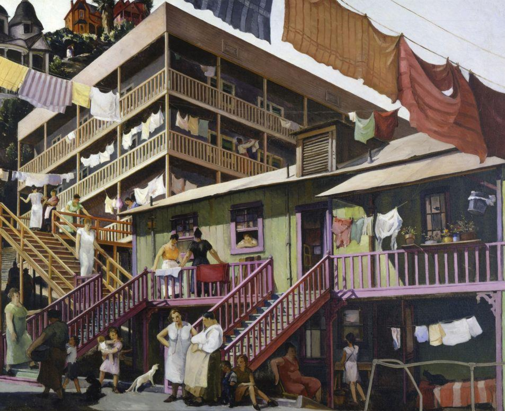
Millard Sheets, Tenement Flats , 1933-1934, oil on canvas, Smithsonian American Art Museum, Transfer from the U.S. Department of the Interior, National Park Service, 1965.18.48