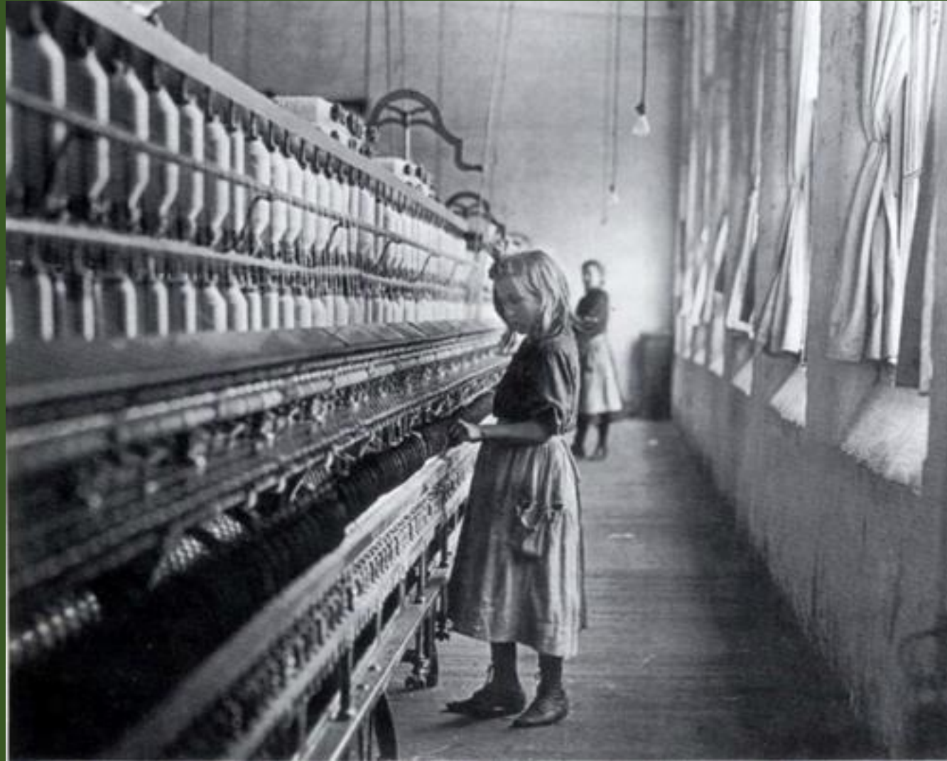
Lewis Hine Child in Carolina Cotton Mill 1908