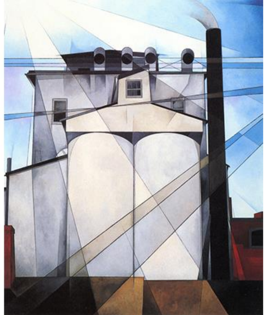
Charles Demuth, left After Sir Christopher Wren , 1920 and My Egypt , 1927. oil on fiberboard, 90.8 × 76.2 cm