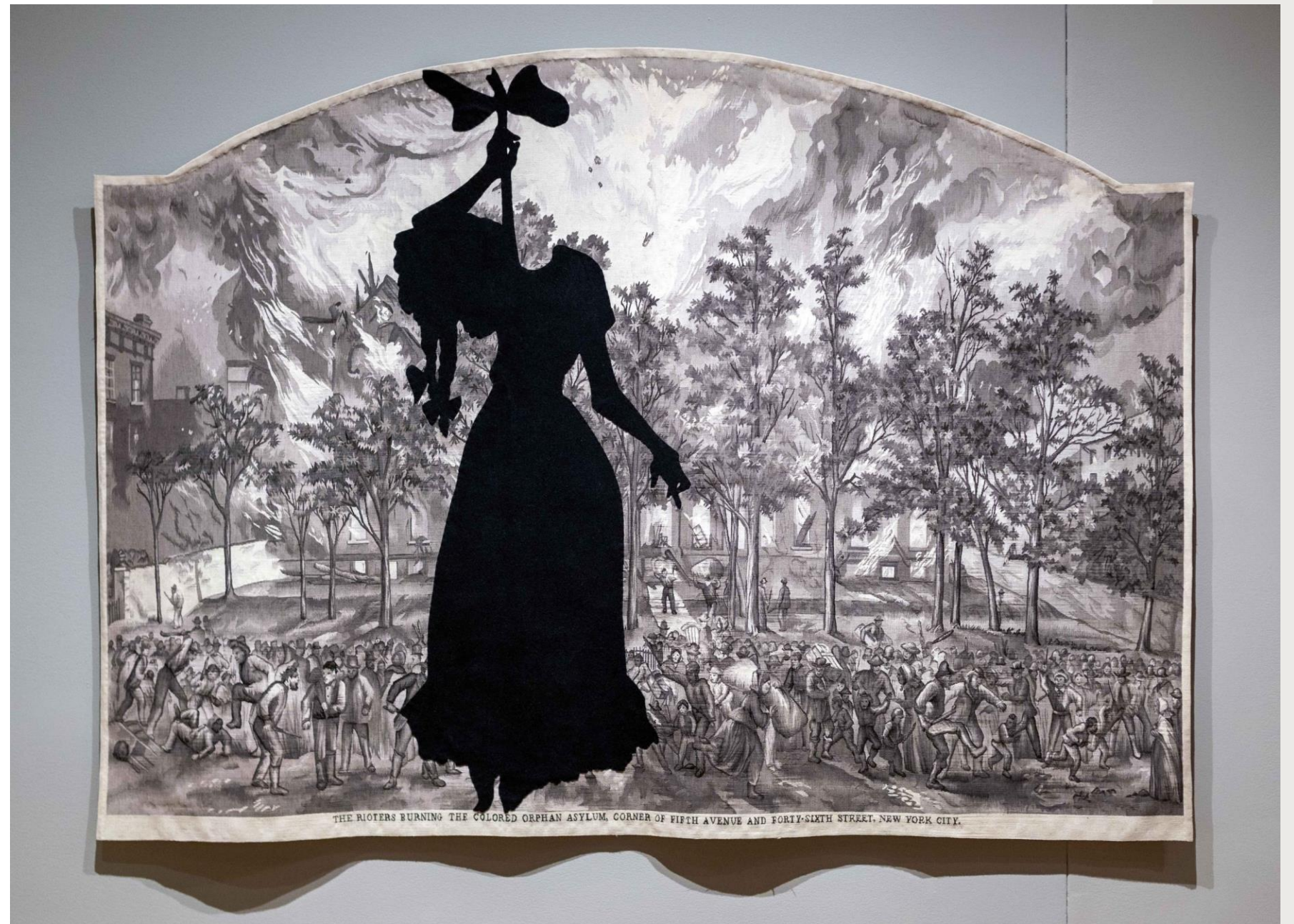
Kara Walker, A Warm Summer Evening in 1863 , 2008, wool tapestry and felt,