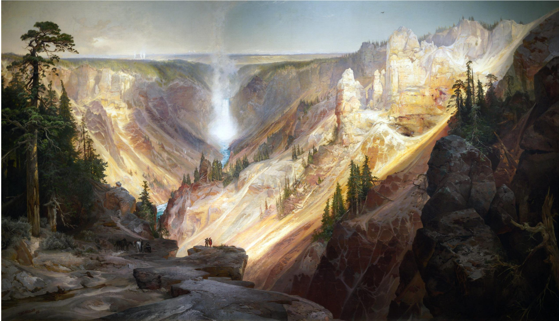
Thomas Moran, Grand Canyon of the Yellowstone , 1872, oil on canvas mounted on aluminum